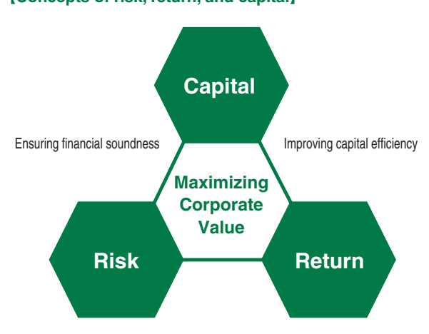
Strengthening risk return management