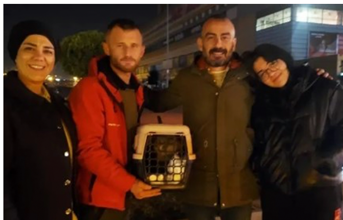
◀ “Cat rescued from the 12th floor in Malatya was handed over to its owners”