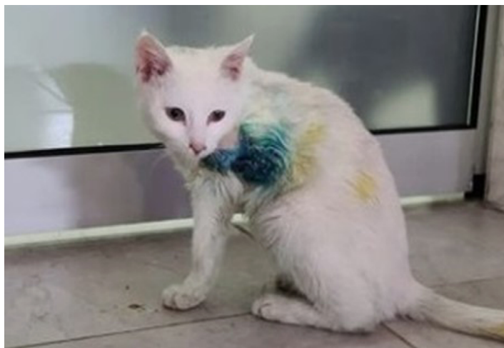
◀ “Rescued from the Kahramanmaraş shelter. One arm was amputated. Adopted”